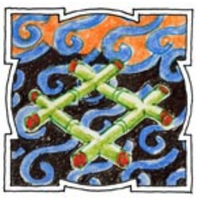
The Raft of the Promoters is woven from a 'canonic' logos whose form is the hypostylar reticule of Infinity. It both carries, guides, and targets the Fiery Germ onto its final destination: the Mountain of the Place.