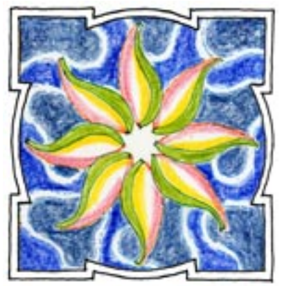
Stage 2: Earth: The element of embodiment. The 'dark sun 'births' from the oceanic deeps as a radiating, growing, floating, efflorescence.