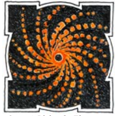
Stage 4: Light: the Element of Sight that forms images. The point of darkness at the centre of the fiery wheel of visual impressions is the dark genesis of 'ideas'.

The final stage is 'thought rendered 'real' - the unique proclivity of our species.