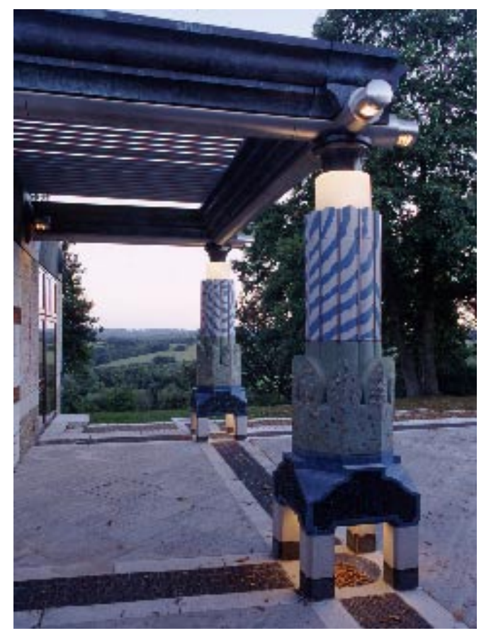
The 'fiery core' of the 'columna lucis' illuminates the cubic 'theatre of appearances' which the Architectural event hollows out of the Mountain.