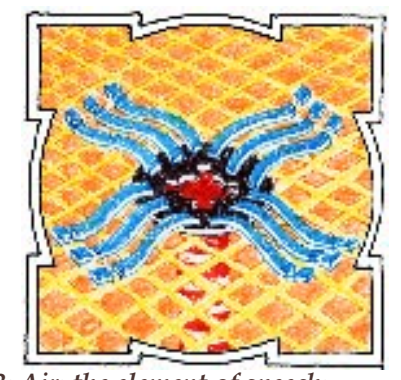
Stage 3: Air: the element of speech: Words flow from the volcanic mouth to quadrate and order the surface of the new earth.

The submarine gestation, is followed by birth onto solid land, the first breath of air and speech, the opening of the eyes to sight.