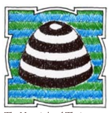
'The Mountain of 'That which was always there'. Nights and days layer into the confused and tangled pile of obduracy that is a 'Place'.